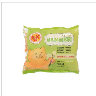
Mini dumplings for children

Product group Meat and meat products Product subgroup Fresh processed meat products, Meat dumplings Product code 1902 40 10 Product line