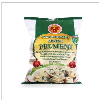
Traditional dumplings without E substances

Product group Meat and meat products Product subgroup Fresh processed meat products, Meat dumplings Product code 1902 40 10 Product line