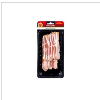
Attractive, easy usable skin packaging.

Product group Meat and meat products Product subgroup Processed meat products, Smoked Product code 1602 49 19 Product line