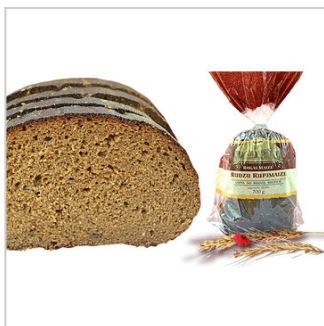
Naturally fermented rye bread

Product group Cereals and cereal preparations Product subgroup Bread, Rye bread Product code 1905 Product line