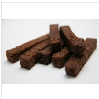
Rye bread, oil, garlic, salt

Product group Cereals and cereal preparations Product subgroup Pastrycooks' products Product code 1905 Product line