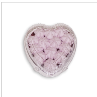
Blueberry ice cream cake with blueberry jam.

Product group Other Product subgroup Ice cream Product code 2105 00 Product line