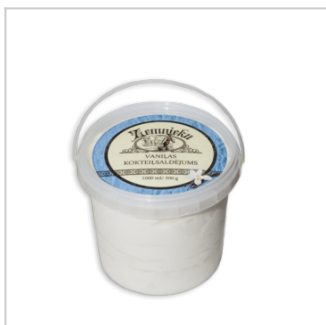
Made from Latvian farmer goods - natural cow milk and sweet cream.

Product group Other Product subgroup Ice cream Product code 2105 00 Product line Zemnieku saldējums / Farmer's ice cream