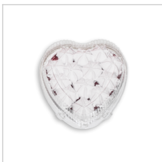
Vanilla ice cream cake with strawberry jam.

Product group Other Product subgroup Ice cream Product code 2105 00 Product line