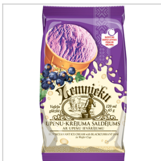
Made from Latvian farmer goods - natural cow milk and cream.

Product group Other Product subgroup Ice cream Product code 2105 00 Product line Zemnieku saldējums / Farmer's ice cream