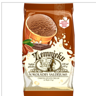
Made from Latvian farmer goods - natural cow milk and cream

Product group Other Product subgroup Ice cream Product code 2105 00 Product line Zemnieku saldējums / Farmer's ice cream