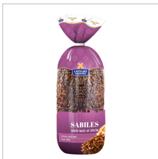
Rye bread with seeds, sliced

Product group Cereals and cereal preparations Product subgroup Bread, Bread with seeds, nuts, fruit etc. Product code 1905 Product line Sabiles