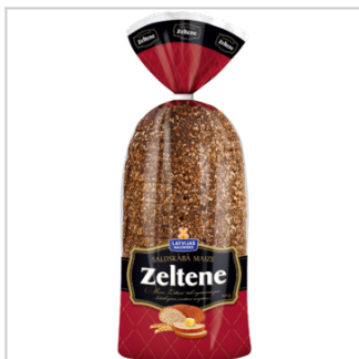
Sour-sweet bread, sliced

Product group Cereals and cereal preparations Product subgroup Bread, Mixed flour bread Product code 1905 Product line Zeltene