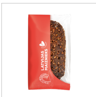
Frozen rye bread with grains

Product group Cereals and cereal preparations Product subgroup Bread, Frozen bread Product code 1905 Product line