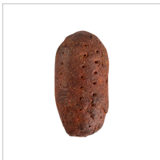
Frozen rye bread with smoked meat

Product group Cereals and cereal preparations Product subgroup Bread, Frozen bread Product code 1905 Product line