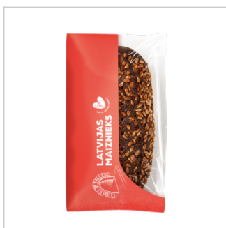
Frozen sour-sweat bread with grains

Maris Daude Speak: English, Latvian, Russian +371 67617261 maris.daude@maiznieks.lv