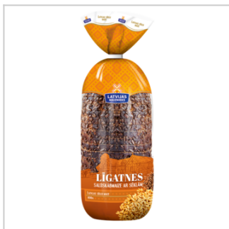
Sour-sweet bread with seeds, sliced

Product group Cereals and cereal preparations Product subgroup Bread, Bread with seeds, nuts, fruit etc. Product code 1905 Product line Līgatnes