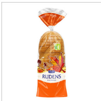
White bread, sliced

Product group Cereals and cereal preparations Product subgroup Bread, Wheat bread Product code 1905 Product line Rudens