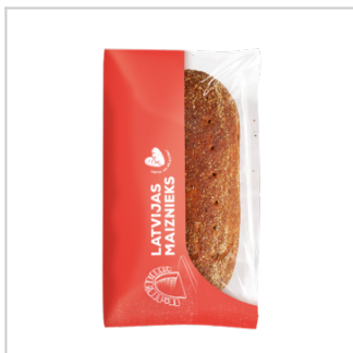
Frozen rye bread with carrots

Product group Cereals and cereal preparations Product subgroup Bread, Frozen bread Product code 1905 Product line