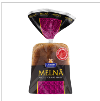
Shaped black rye bread, sliced

Product group Cereals and cereal preparations Product subgroup Bread, Rye bread Product code 1905 Product line Melnā