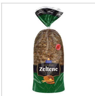
Rye bread, sliced

Product group Cereals and cereal preparations Product subgroup Bread, Rye bread Product code 1905 Product line Zeltene